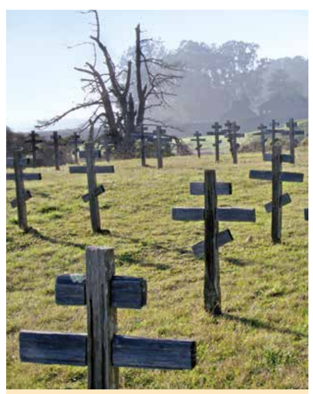
Russian-American Company Cemetery