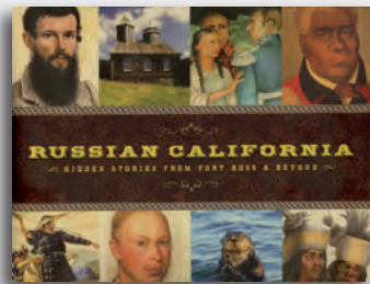
Russian California: Hidden Stories from Fort Ross and Beyond (with $100 Donation)

Becoming a member of Fort Ross Conservancy promotes stewardship of Fort Ross and Salt Point parks. Benefits of initial membership and annual renewals are our annual paper newsletter, monthly electronic newsletters, and 10% discount on purchases (including mail orders) at the Visitor Center Bookshop.