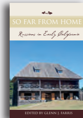
So Far From Home (with $100 Donation)

Becoming a member of Fort Ross Conservancy promotes stewardship of Fort Ross and Salt Point parks. Benefits of initial membership and annual renewals are, monthly electronic newsletters, and 10% discount on purchases (including mail orders) at the Visitor Center Bookshop.