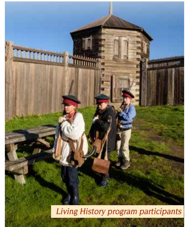
Living History program participants