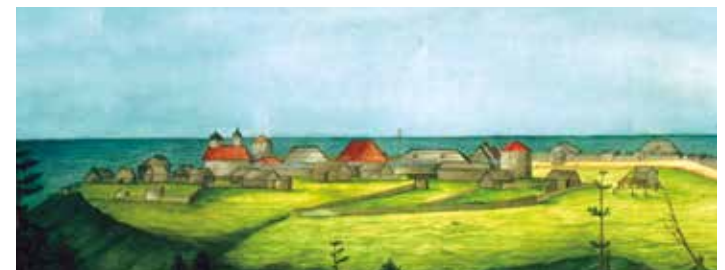
Settlement Ross, 1841 by I.G. Voznesenskii