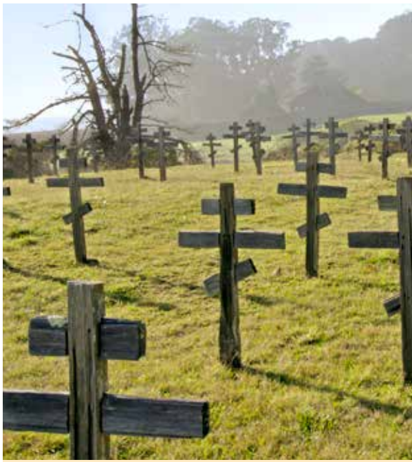
Russian-American Company Cemetery

Fishing —Abalone and rockfish usually abound in the coastal waters in season. However, there have been recent abalone closures. Check before diving.