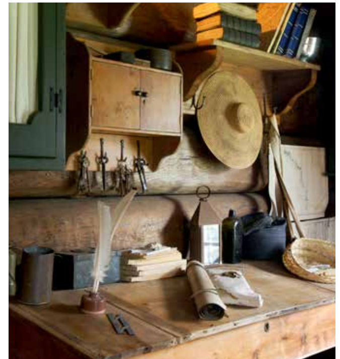
Artifacts of settlement life